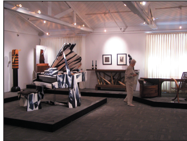
Wendell Castle’s “Steinway”...