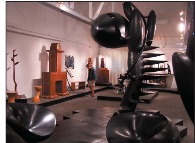
...and his “A New Environment”