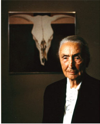
Georgia O'Keeffe

Best known for her paintings of colored flowers, New York Skyscrapers, and New Mexico landscapes, Georgia O'Keeffe was an influential American Artist. One of Art in Action's 4th Grade lessons highlights O'Keeffe's Poppies masterpiece and explores her contribution to modern art. Included in this article are student art pieces inspired by O'Keeffe.