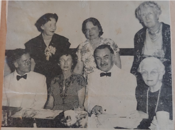
Artists Entertain . . .