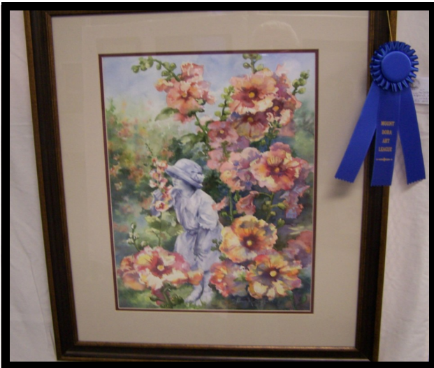
Spirit in the Garden