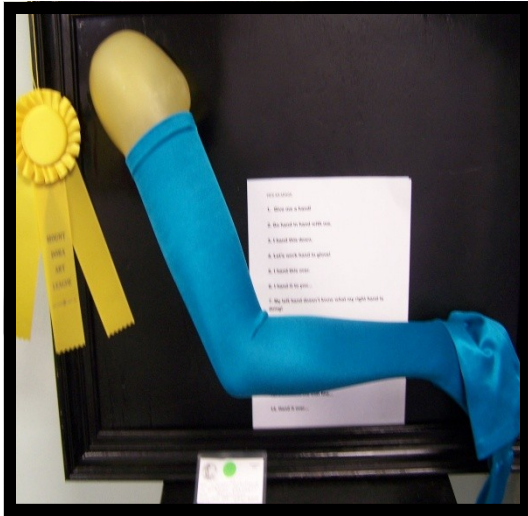
27 Adages-Pick One