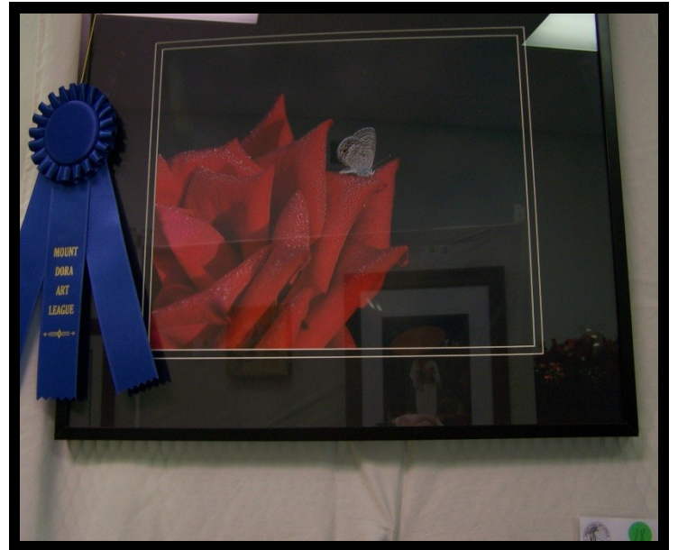
Little Miss Hairstreak