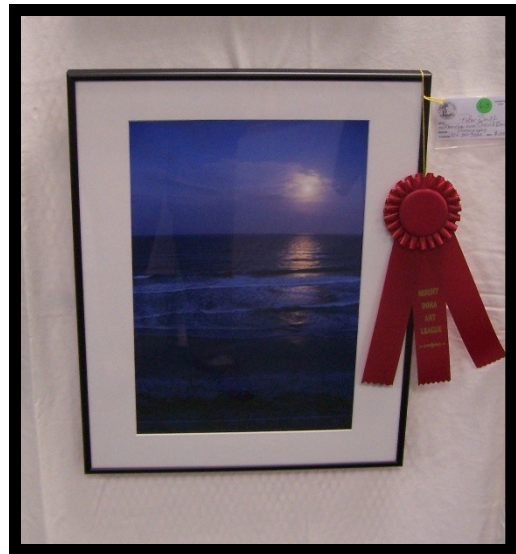
Moonrise over Ormond Beach