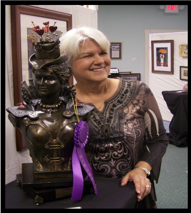
The Queen of Hearts