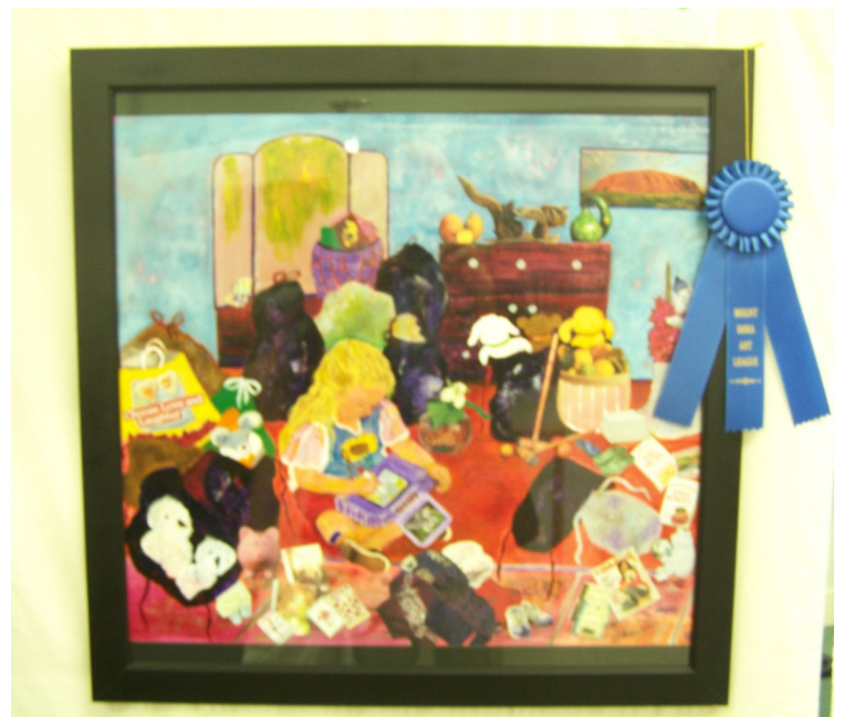
Sami Helps Grami Clean