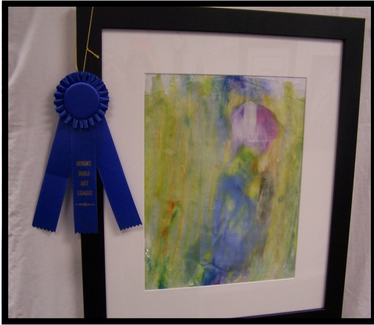
Li'l Girl in Blue