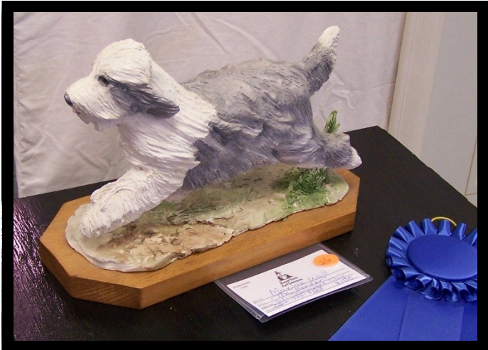
Maxine Wall - "The Herder" - Sculpture