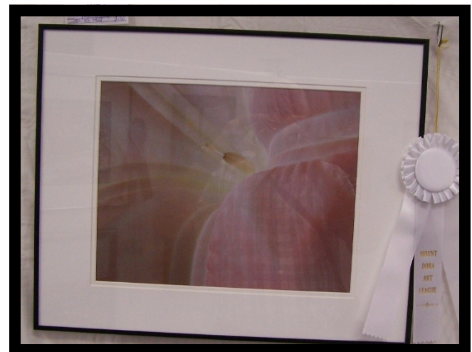
Martha Overhiser "Inside the Trumpet Flower" - Photography