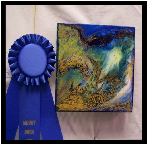
Carrie Knupp - "Ancient Abstract" - Encaustic