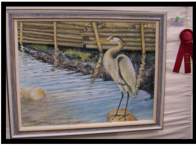
Eva Cook - "The Sentry" - Acrylic