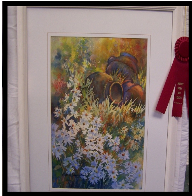
Arlene Shoemaker - "Daisy Glow" - Watercolor