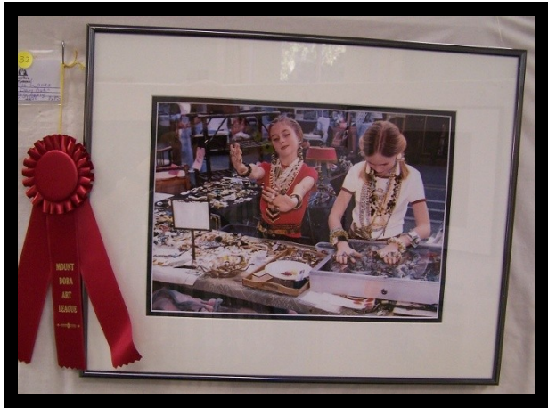
Phyllis Levee - "Girls' Day Out" - Photography