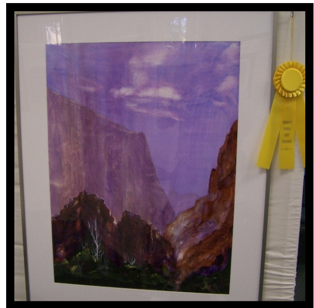
Shirley Sojourner "Mountain Vista":Acrylic