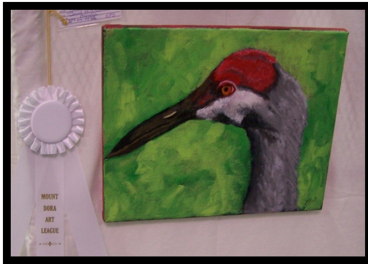
Pat DeWeese - "Sand Hill Crane" - Acrylic