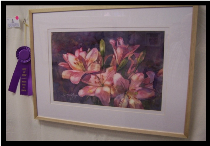
Best in Show: Susan Grogan - "Bright and Beautiful" Watercolor