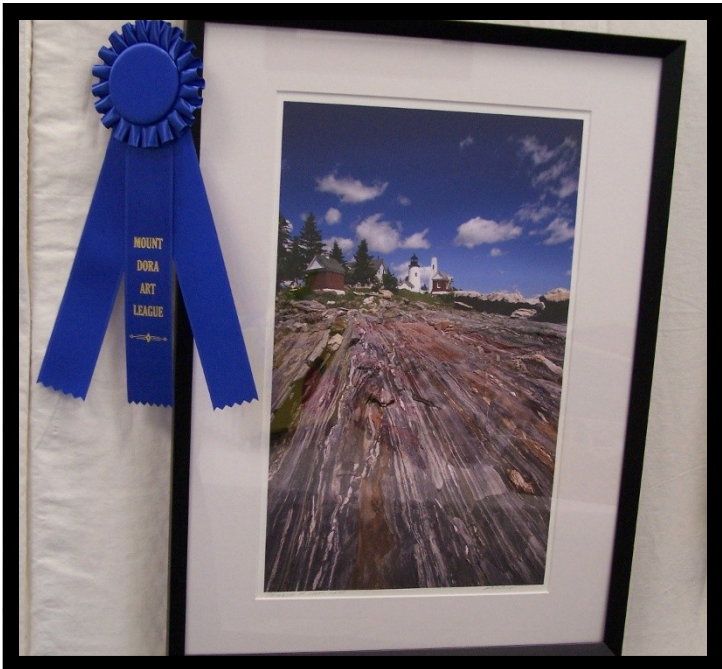
Pete Smith - "Pemaquid Point, ME" - Photography