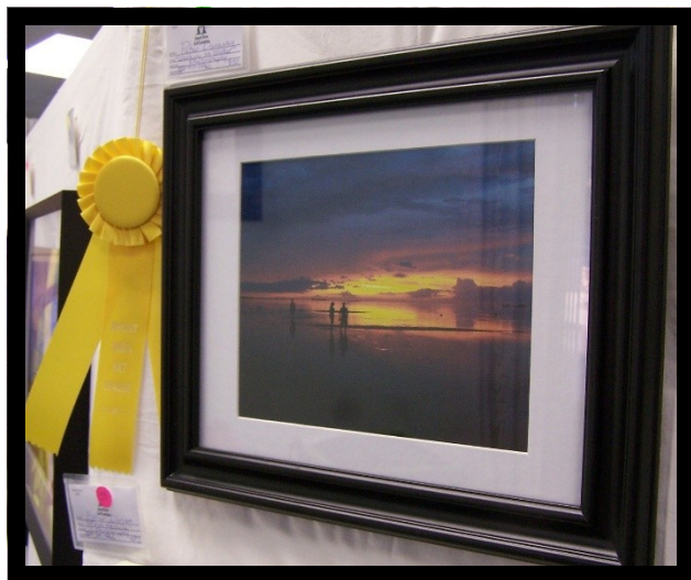
Peter Dunaway "Walking on Water" Photography